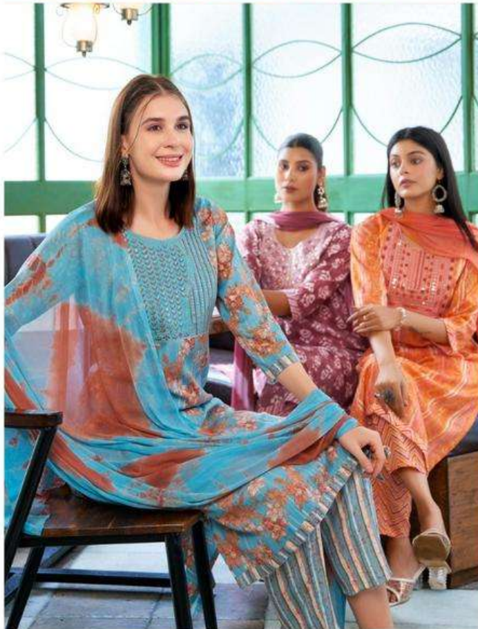
Embroidered Kurti, Designer Kurtis, Printed Kurti, Cotton Kurtas, Lenin Kurtis, Georgette Kurti, Long Kurtis, Short Kurtis, Traditional Kurti, Ethnic Kurtis and Fashion Kurtis are the variants of Indian Kurtis