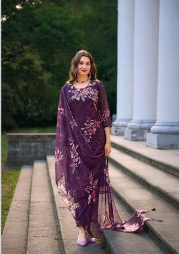
I like my money right where I can see it...hanging in my closet D.NO. 1294