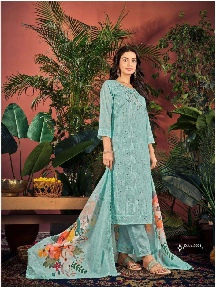
"Elegance Woven in Every Thread, Dresses that Define True Beauty."

A SYMPHONY of fresh tones and FLORAL IMAGERY SPRING SUMMER 20 2 4