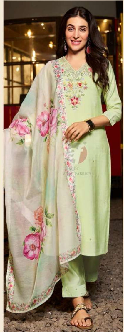
Chandani VOL-3 D.no.3736