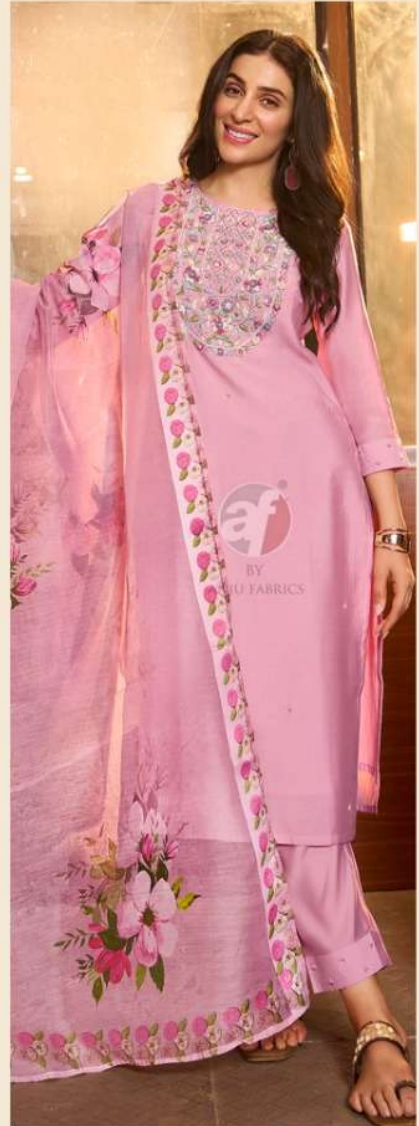
Chandani VOL-3 D.no.3733