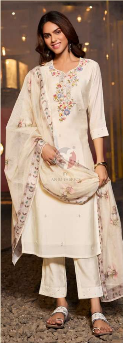
Chandani VOL-3 D.no.3734