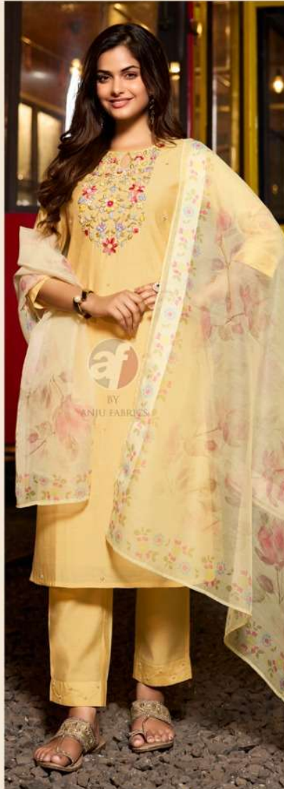
Chandani VOL-3 D.no.3732