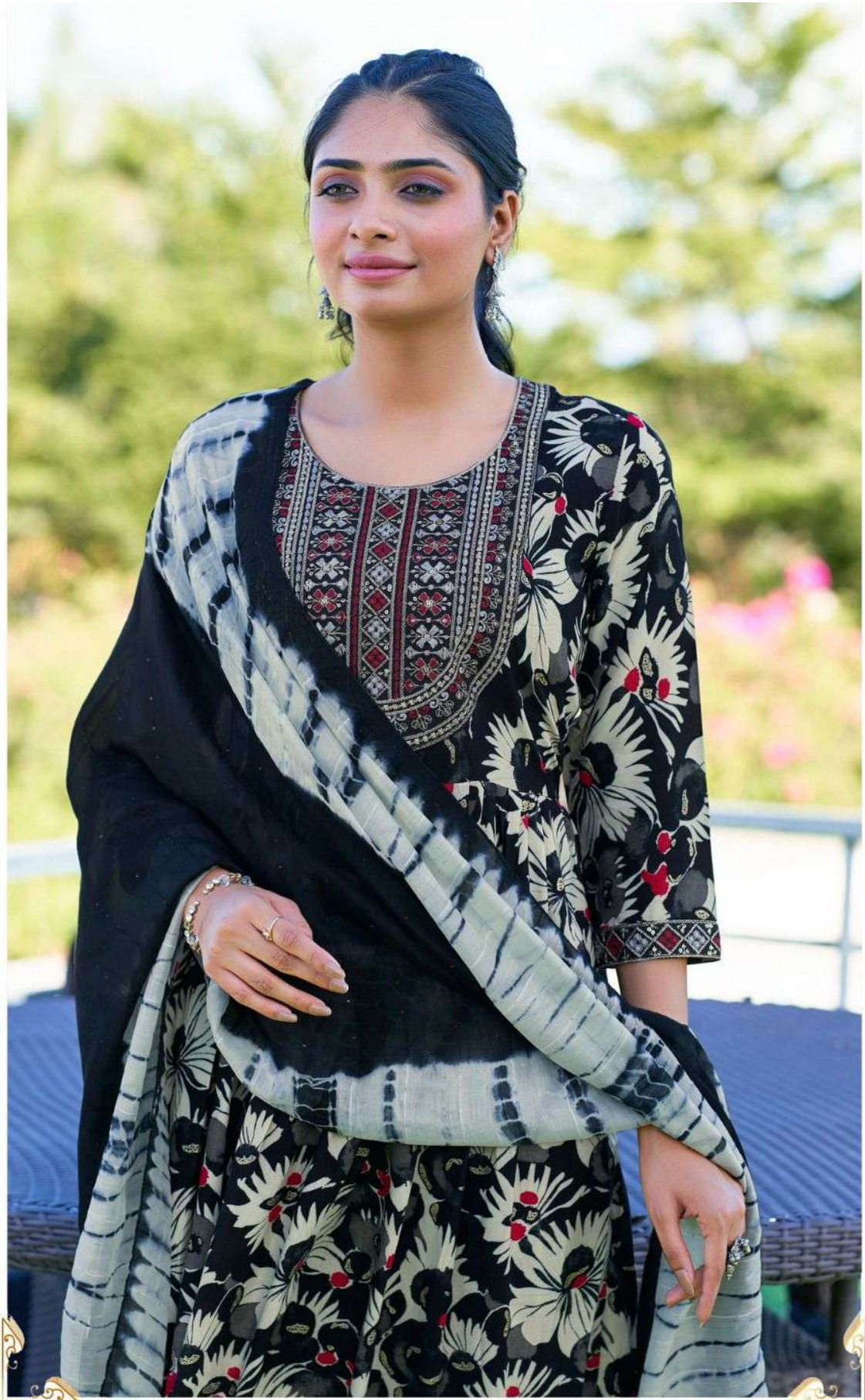
Luxe fabrics, bold patterns & sumptuous detailing adorn modern silhouettes