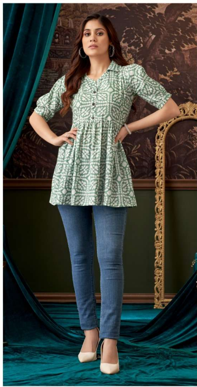
D No. 1004