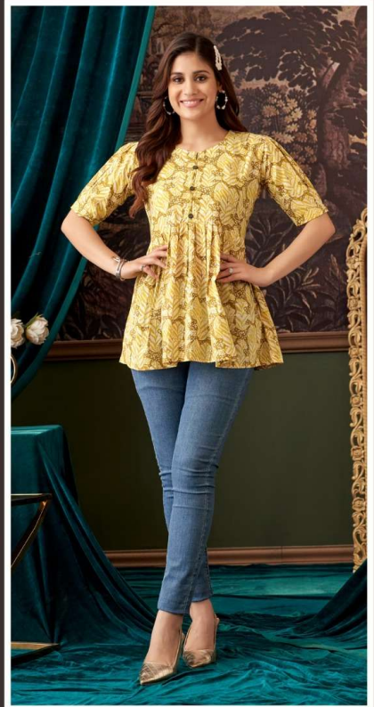
D No. 1005