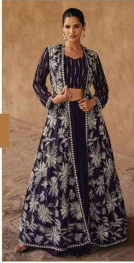
• 5388 •