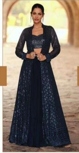
• 5390 •