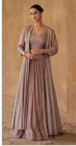
• 5389 •