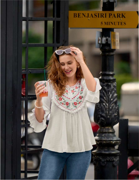
You can't scroll without complimenting my new Kurti swag

LILY&LALI® GULS PRIDE A PRODUCT OF THE LAL GROUP