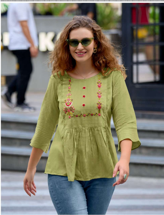
You don't have to be a model to gain attention. Wearing a dazzling Kurti is enough