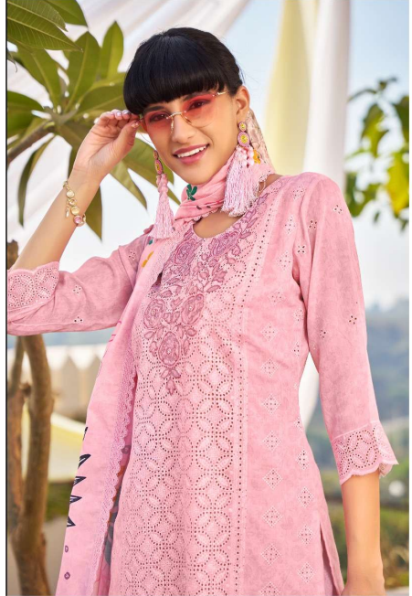
Fashion should be stylish & fun.I still appreciate individuality style is much more interesting than fashion; really.