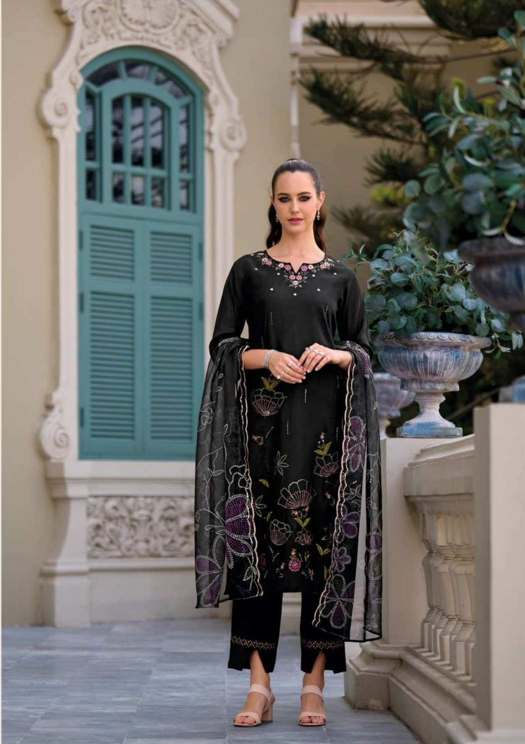
1186 Elegance is not standing out, but being remembered