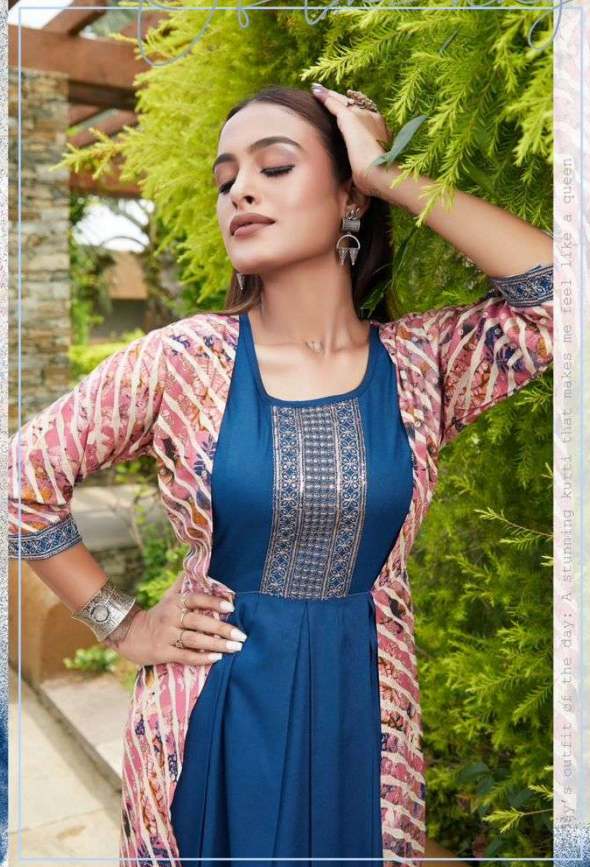
My outfit of the day: A stunning kurti that makes me feel like a queen