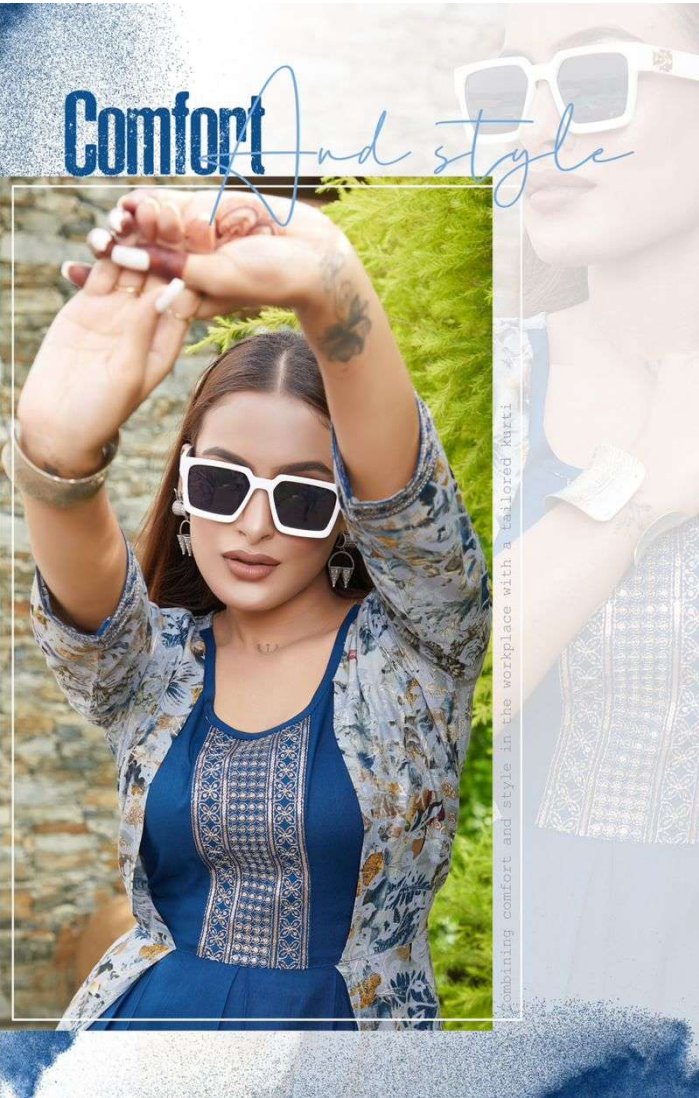
Combining comfort and style in the workplace with a tailored kurti.