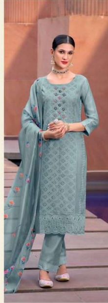
CK - 13904