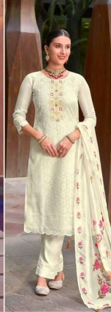
CK - 13905