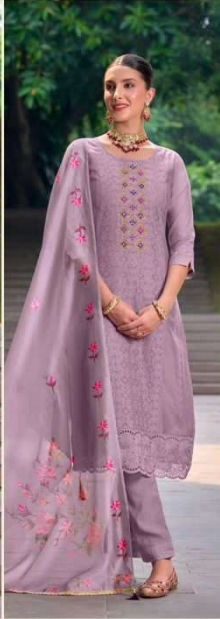
CK - 13903