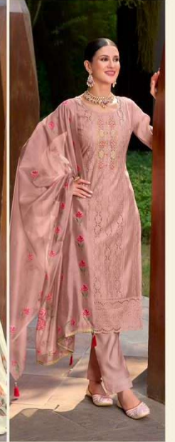
CK - 13906