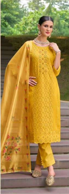
CK - 13902