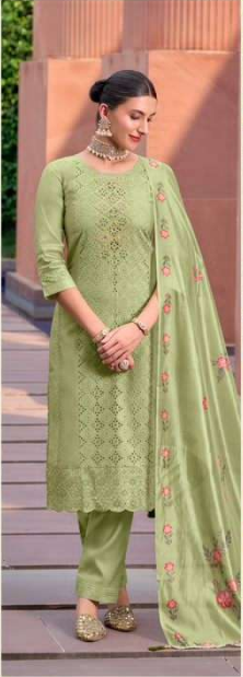
CK - 13901