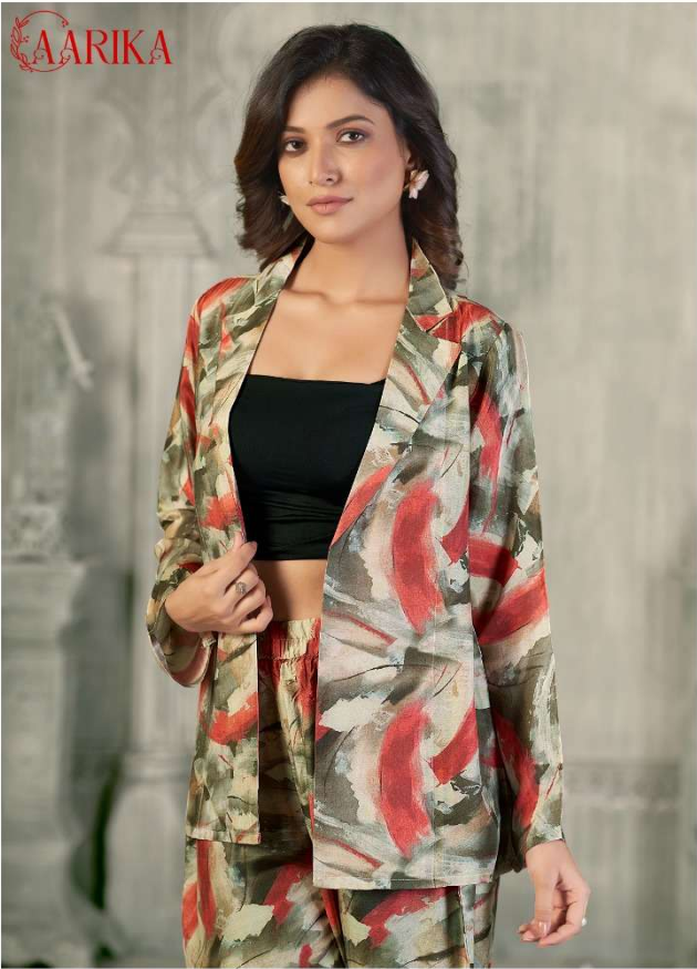
D.No:4913 Fashion you can buy, but style you possess. The key to style is learning who you are, which takes years. There's no how-to road map to style. It's about self-expression and, above all, attitude.