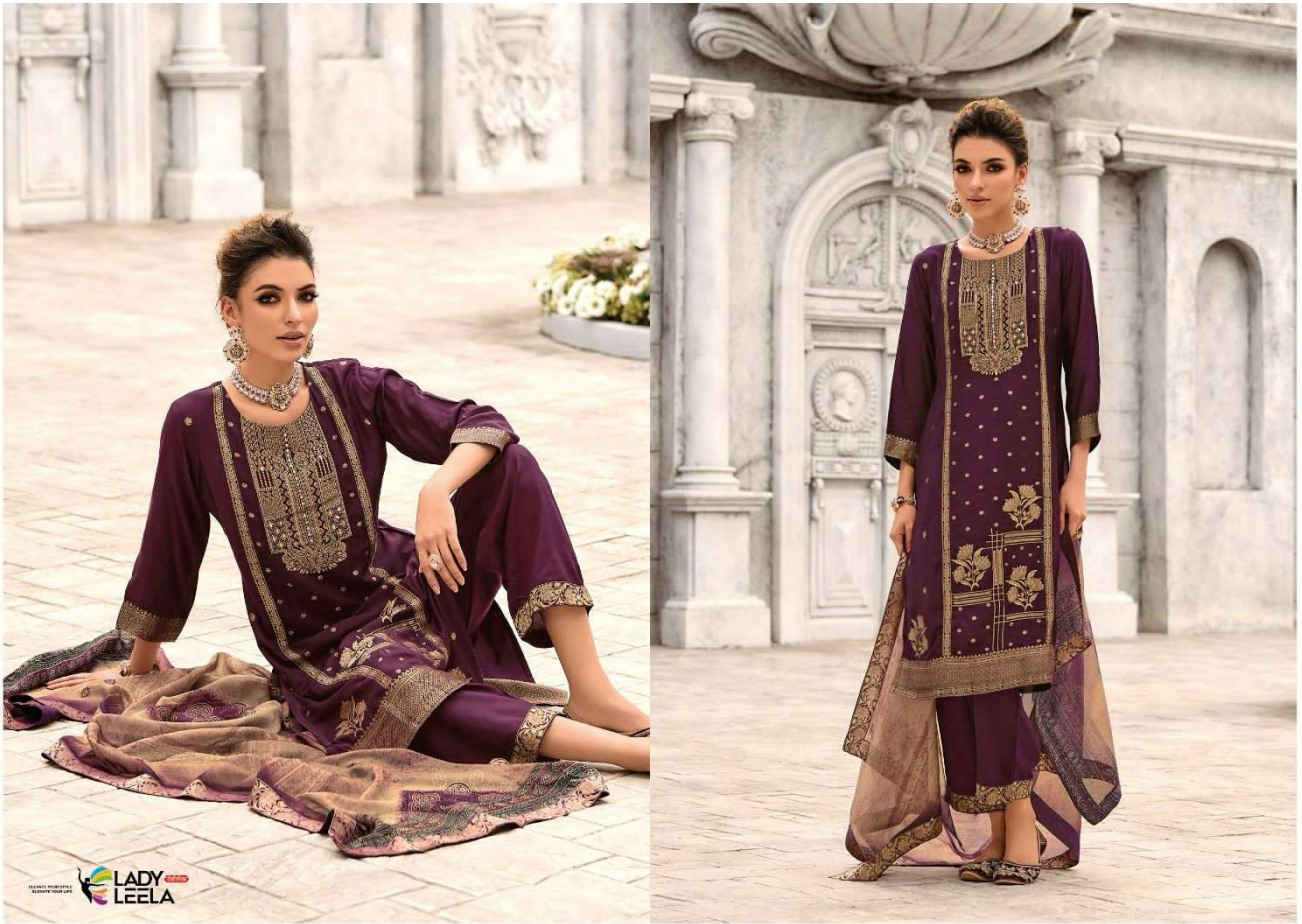
1063 : THINK DIFFERENT