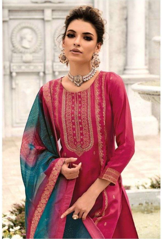
1061 : THINK DIFFERENT