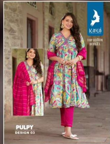
PULPY DESIGN 03