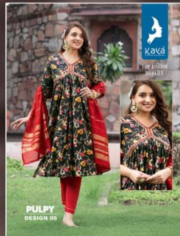
PULPY DESIGN 06