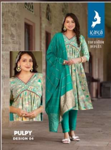
PULPY DESIGN 04