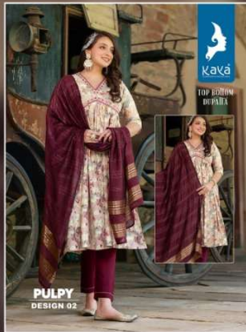
PULPY DESIGN 02