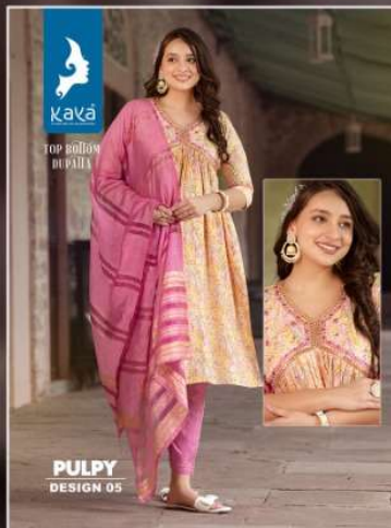
PULPY DESIGN 05