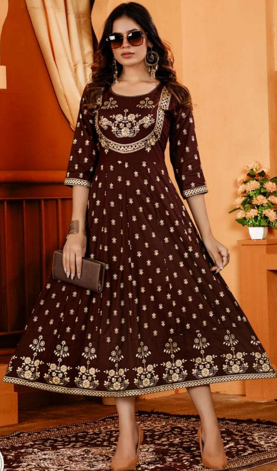
KHATTI METTI 104