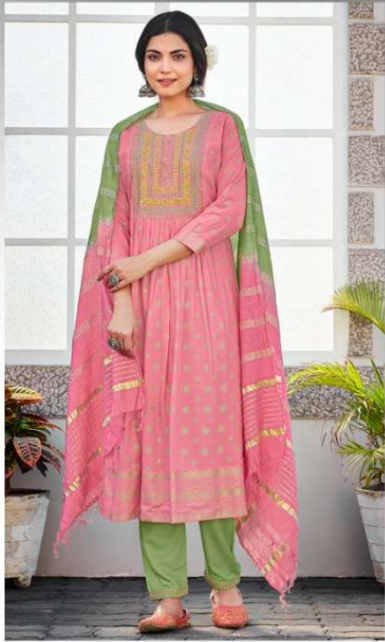
D NO. : 1001