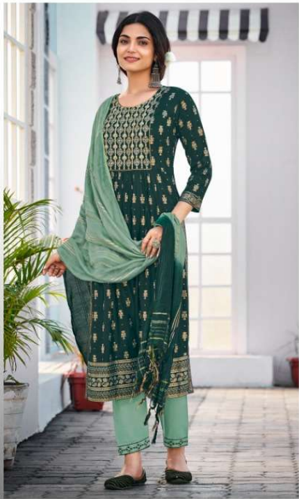
D NO. : 1003