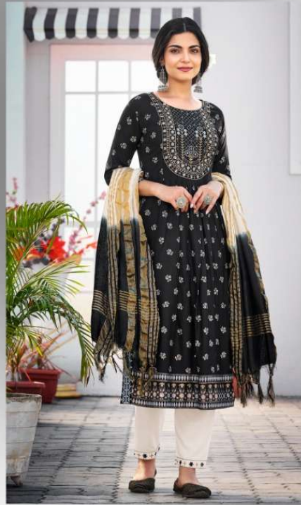
D NO. : 1002