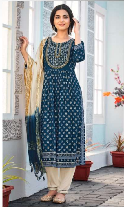
D NO. : 1004