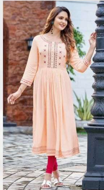
d.no : 1012