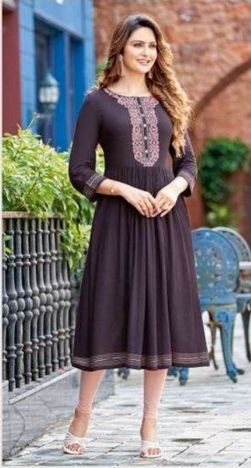
d.no : 1007