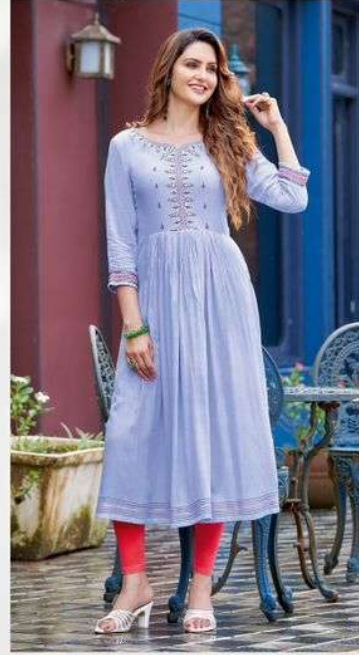
d.no : 1009