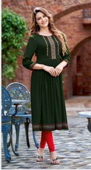
d.no : 1008