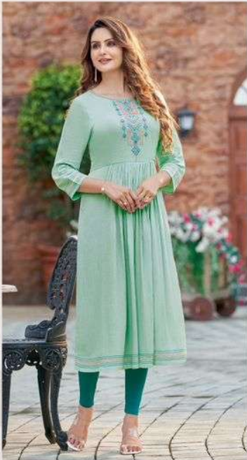
d.no : 1010