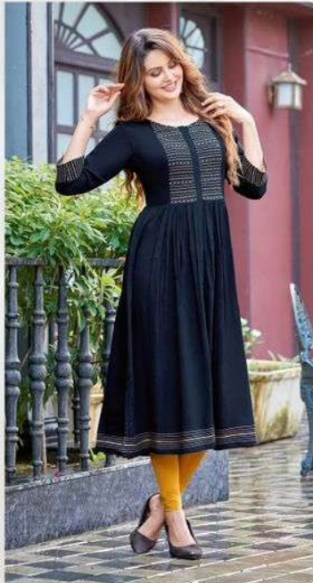
d.no : 1011