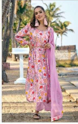
— 40044 —