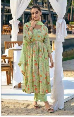
— 40043 —