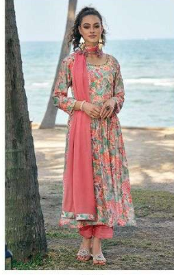
— 40045 —