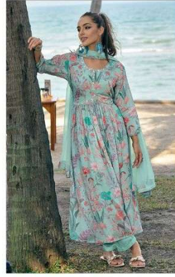
— 40046 —