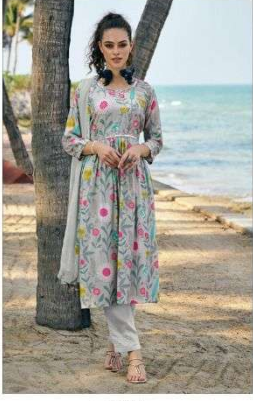
— 40041 —