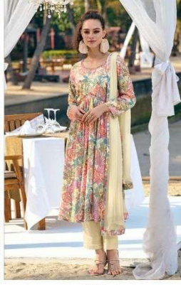
— 40042 —