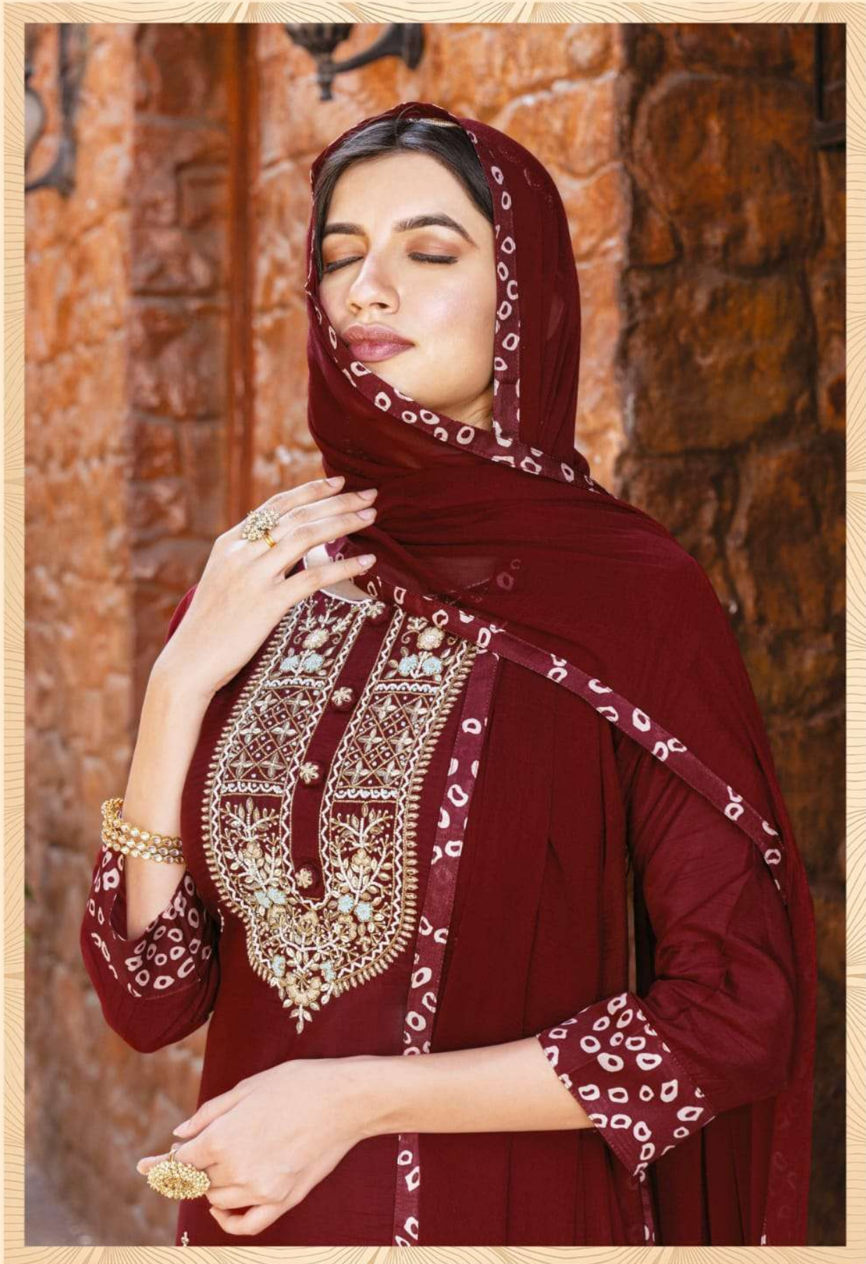
STYLE SUTRA | Profound willingness