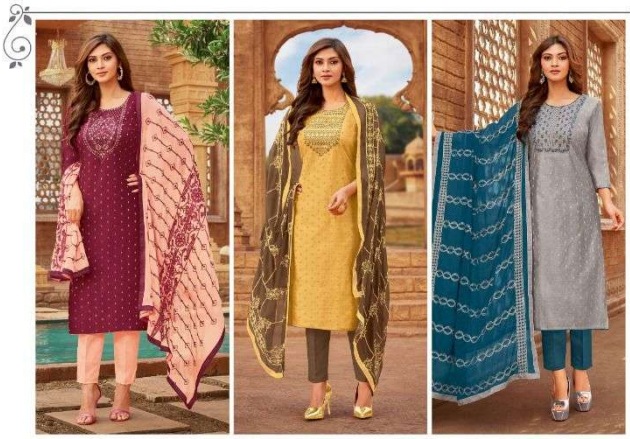
62001 ເຊັກຊັມ 62002 ເຊັກຊັມ 62003 ເຊັກຊັມ