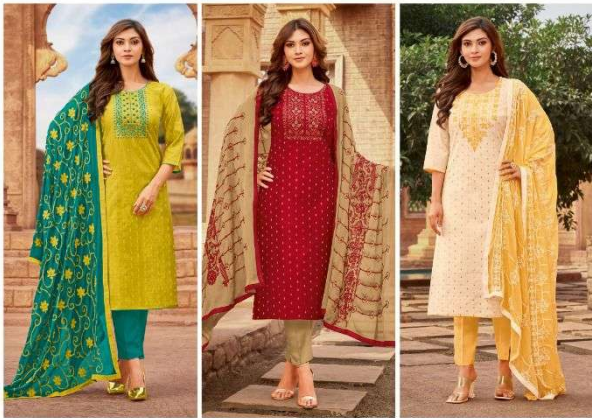
62004 ເຊັກຊັມ 62005 ເຊັກຊັມ 62006 ເຊັກຊັມ