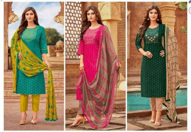
62007 ເຊັກຊັມ 62008 ເຊັກຊັມ 62009 ເຊັກຊັມ