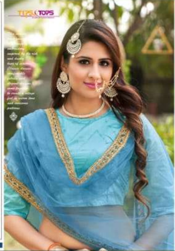
TIPS & TOPS