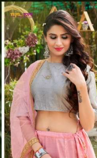
TIPS & TOPS