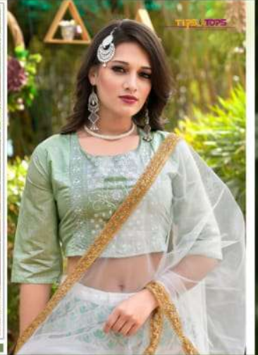
TIPS & TOPS