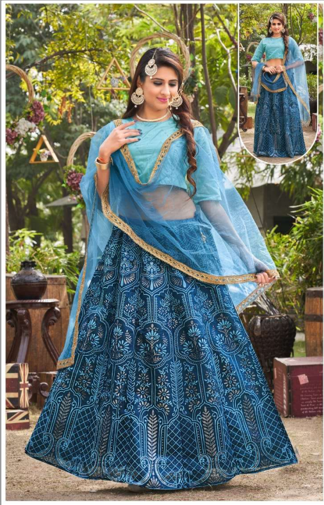
THE SPILLOVER EFFECT ✦ signature piece is one that has our iconic style and top quality craftsmanship, all in one object ✦