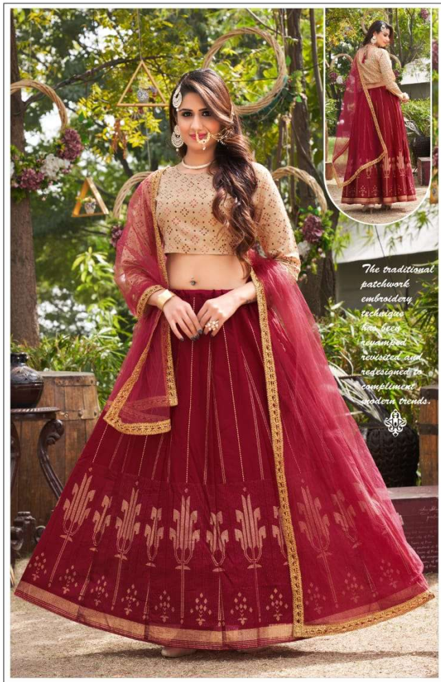
◀ I stay true to myself and my style, and I am always pushing myself to be aware of that and be original ▶ THE ART OF GLAMOUR