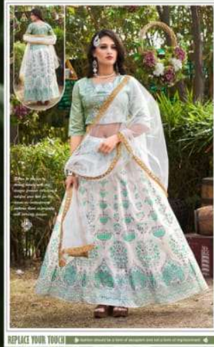
REPLACE YOUR TOUCH