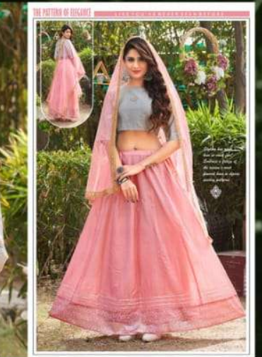
THE PATTERN OF DISCRETION