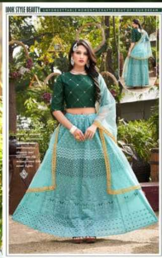
LOOK STYLE BEAUTY