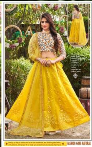
FASHION GONE NATURAL