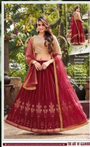
THE ART OF GLAMOUR