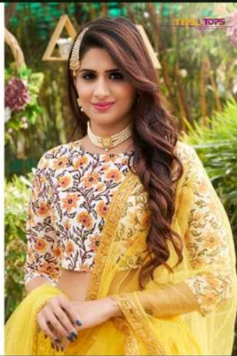
TIPS & TOPS