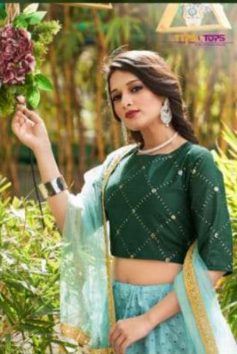
TIPS & TOPS