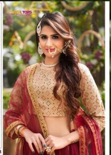
TIPS & TOPS