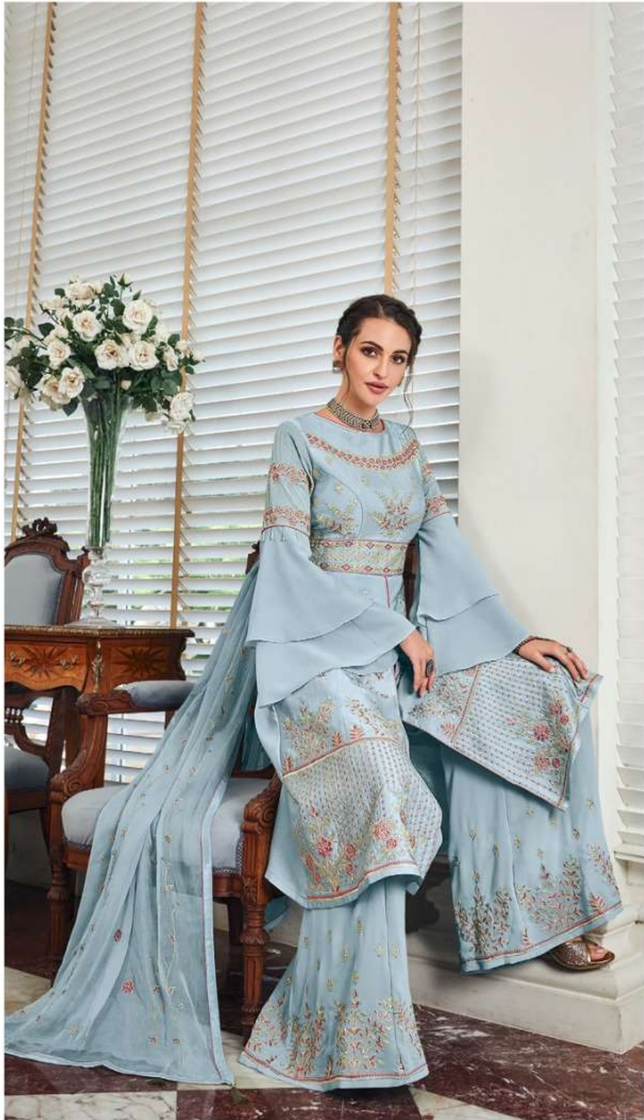
SIMPLE WITHOUT LETTING GO OF ELEGANCE & TRADITION WITH NATURAL FABRICS.