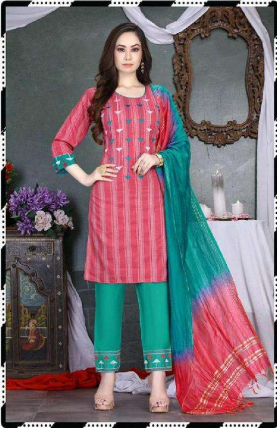
Sensible colors, excellent designs and romantic mood gives perfect combination of sense and sensibility