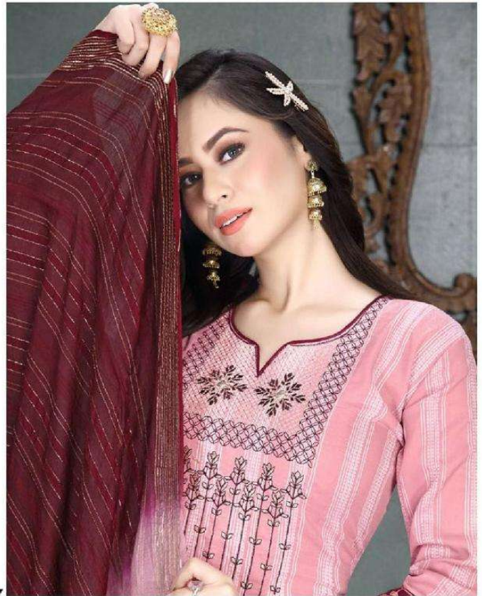
From the fashion archives to current trend reports, the one constant factor is the influence of certain countries ethnicities in designer collection