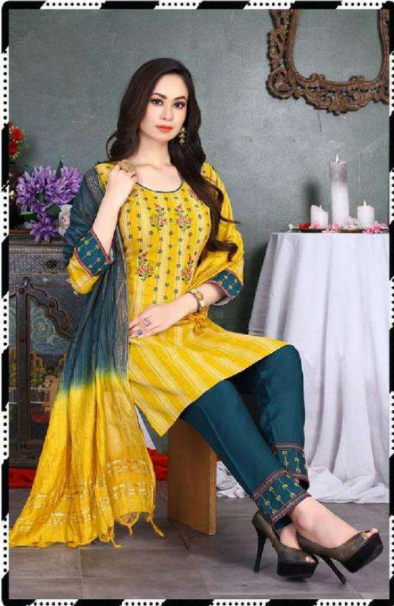
A scintillating plethora of timeless masterpiece inspired by beauty from indian culture