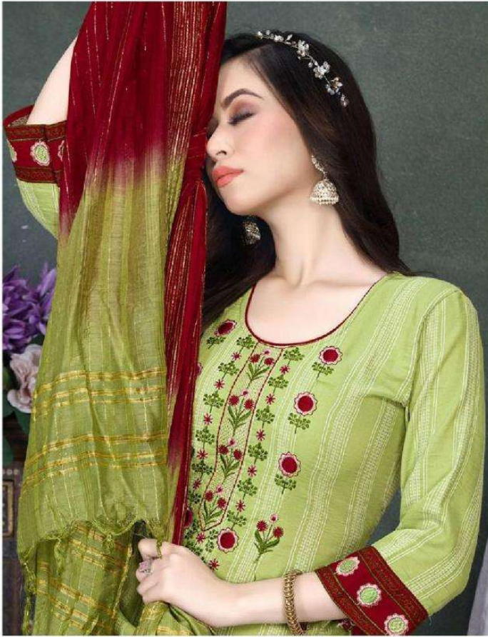
When we chose to take inspiration from Indian beauty, the result is here a set of vivid color designs told a story about great fashion and trends