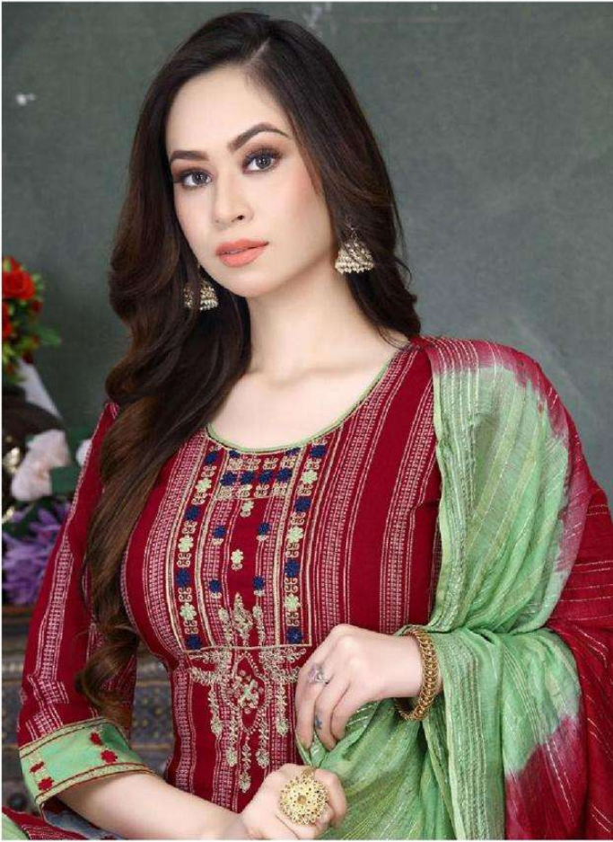
The reflection of cultural clothing and heritage is salwar kameez new collection.