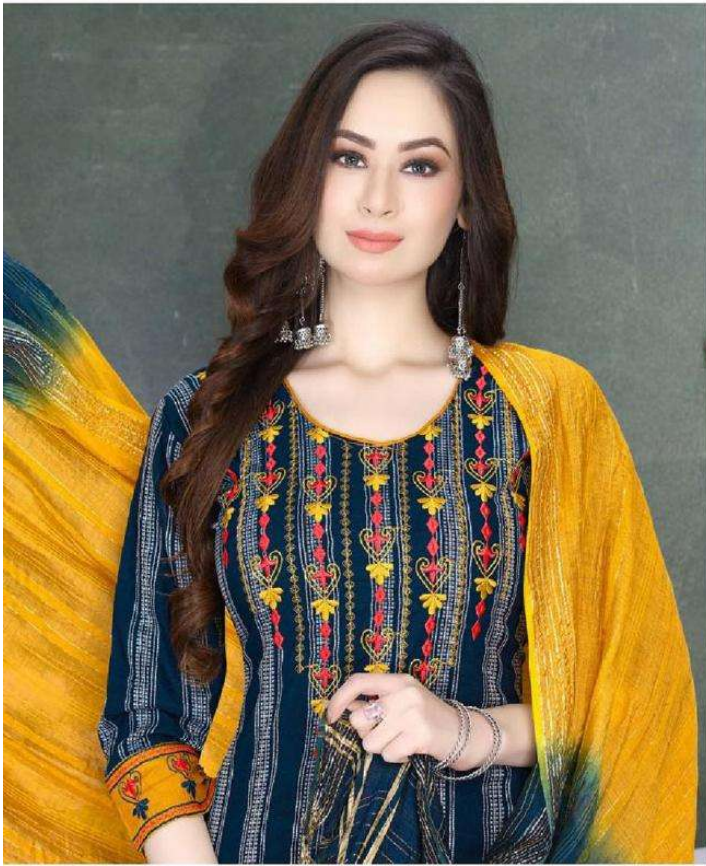
For the occasion that you will cherish for ever, Salwar kameez that is equally timeless.