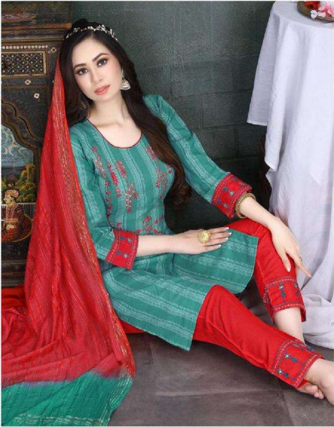
From the fashion archives to current trend reports, the one constant factor is the influence of certain countries ethnicities in designer collection