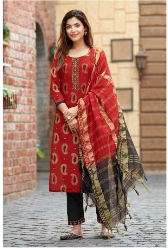
D. NO- 3006