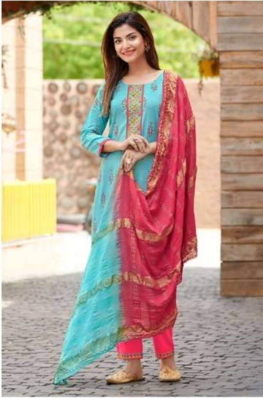
D. NO- 3005