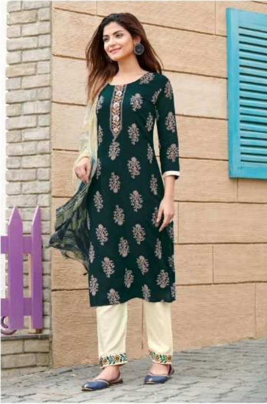
D. NO- 3001