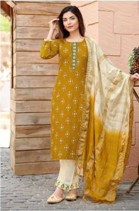
D. NO- 3003