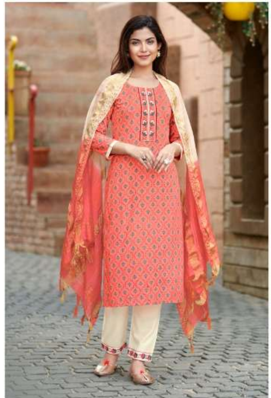
D. NO- 3008