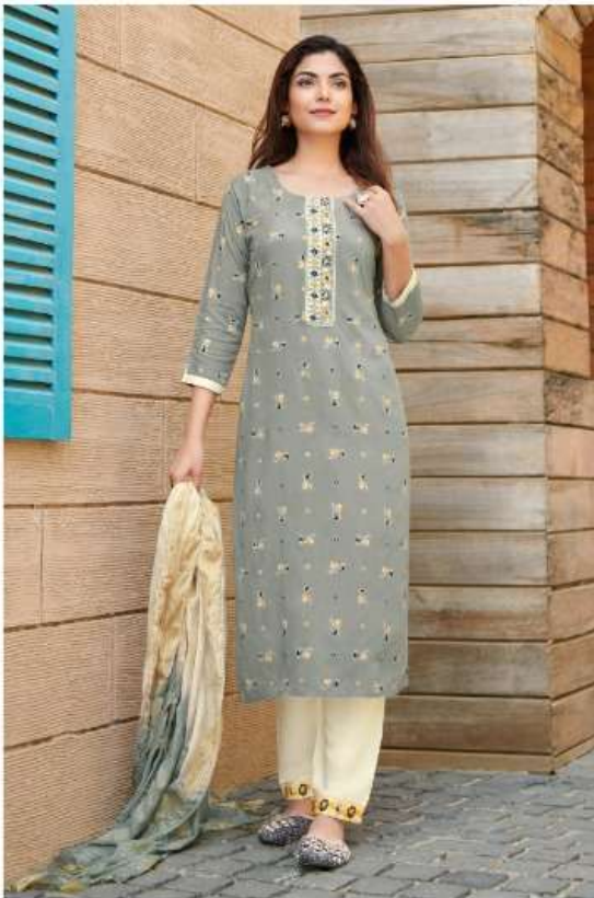
D. NO- 3007