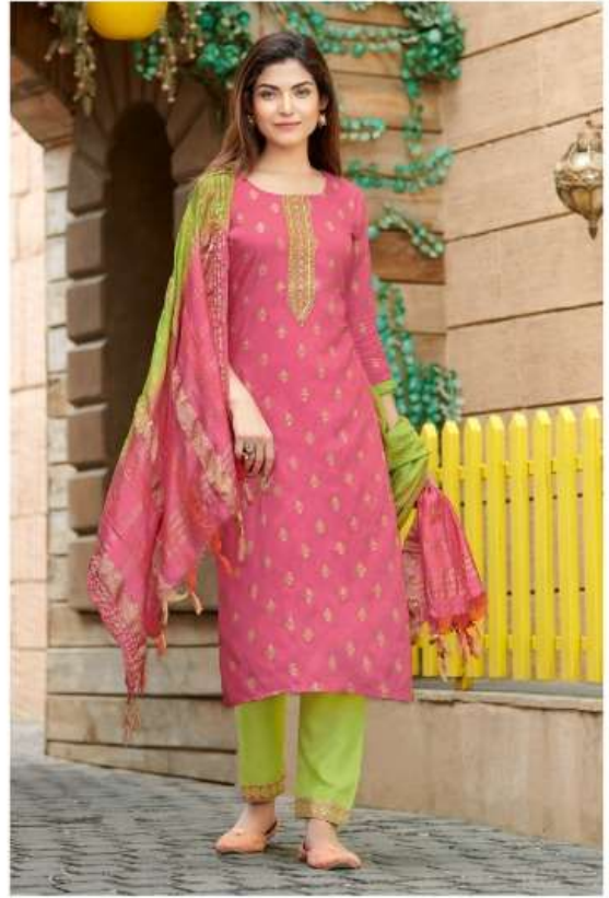
D. NO- 3002