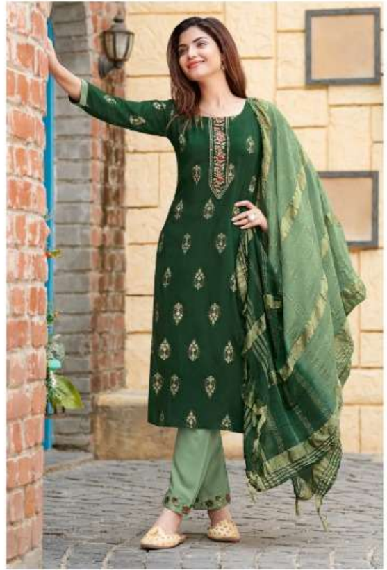
D. NO- 3004