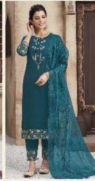
SHAK - 62