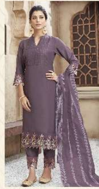
SHAK - 61

FABRIC Top & Bottom Are Chinon With Nylon Organza, Dupatta Is Viscose Organza VALUE ADDITION Embroidery with Heavy Handwork SIZE S, M, L, XL, XXL, XXXL