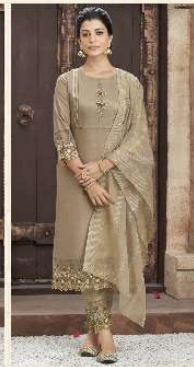
SHAK - 65