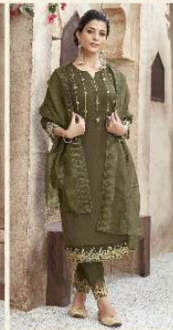
SHAK - 66