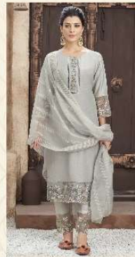
SHAK - 64