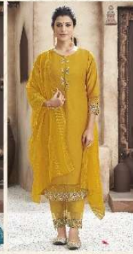
SHAK - 63