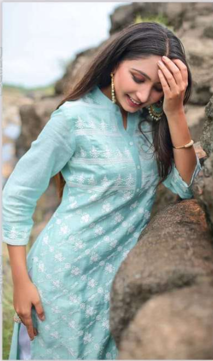
SHQV01 Sea Green - Dyed in a calming hue with embroidery, perfect for everyday wear.