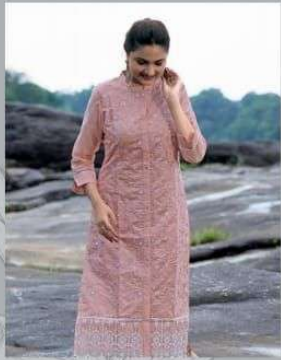
SHFL - 03