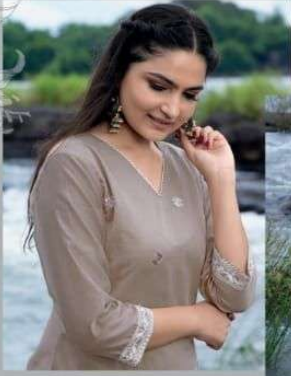
SHFL - 04