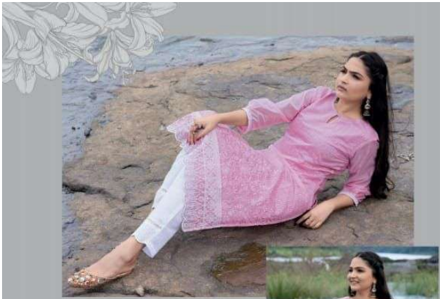
SHFL - 02