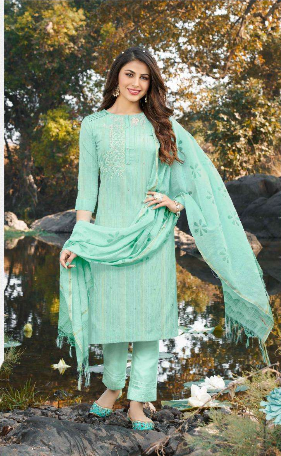
2262 This bright shade outfit will never fail to make you a stunner; embrace the entire gaze while you walk in to the world wearing this magnificent piece.