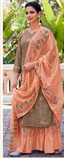
CODE | 3495