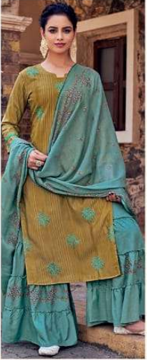
CODE | 3491