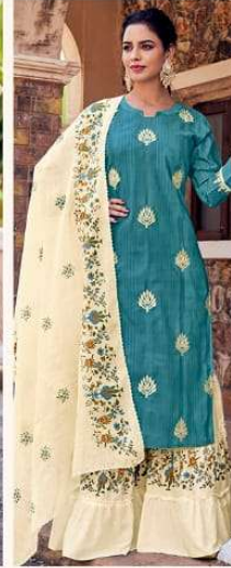
CODE | 3496