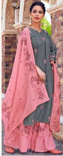
CODE | 3493