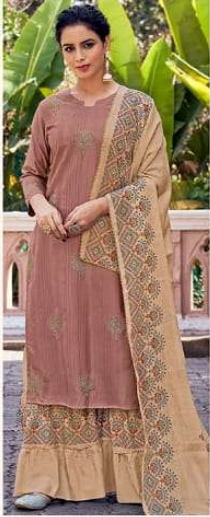
CODE | 3492