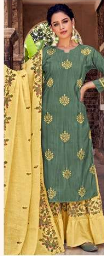
CODE | 3494