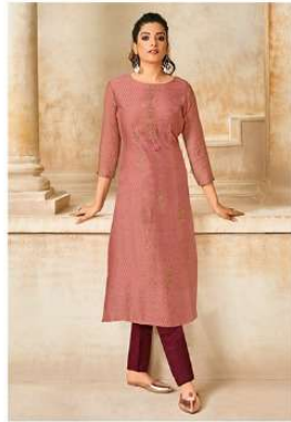
CODE | 3244