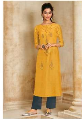
CODE | 3247