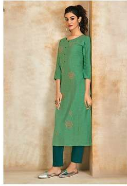
CODE | 3242