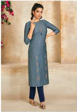
CODE | 3243