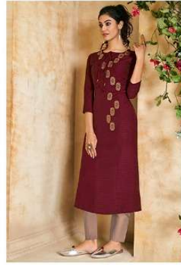
CODE | 3245