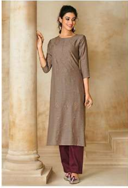
CODE | 3241