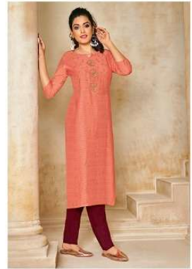
CODE | 3248