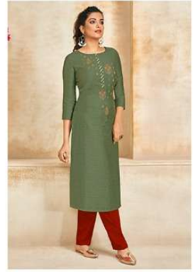
CODE | 3246