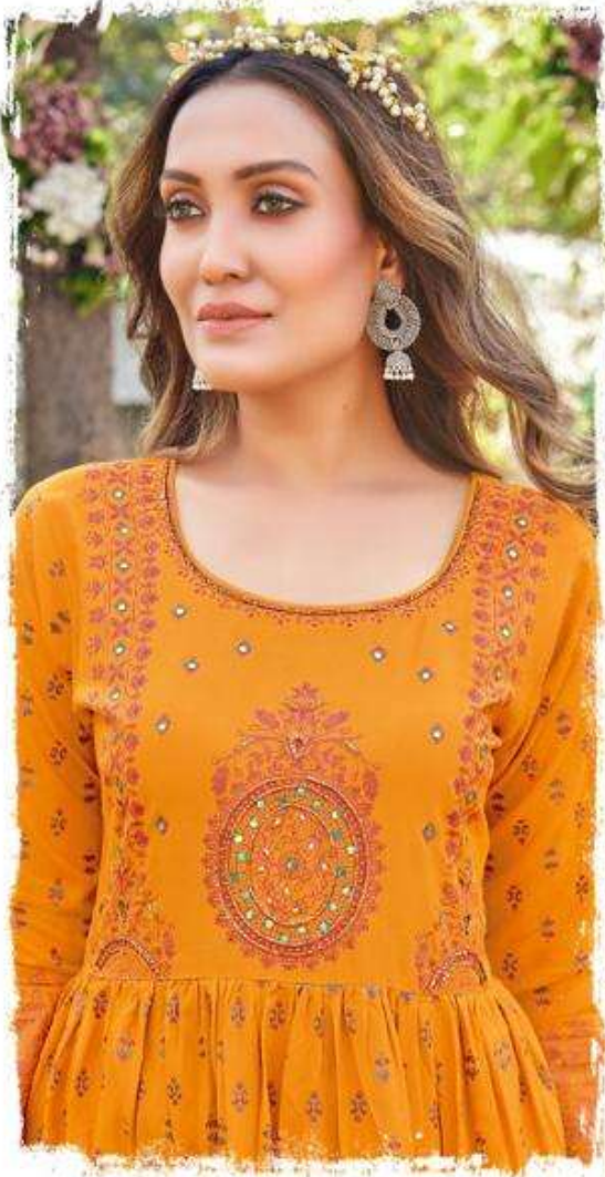
Top With Pant