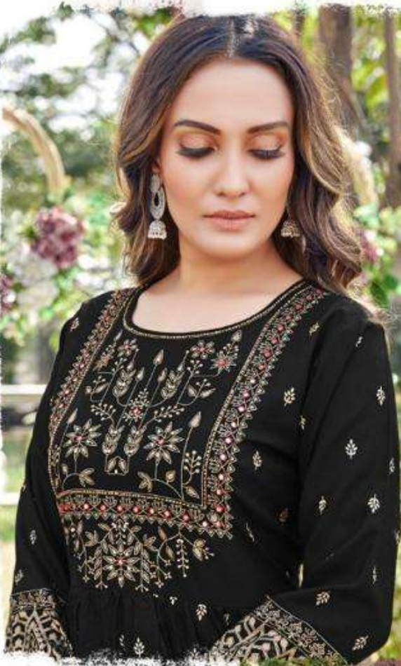
Top With Pant 1002