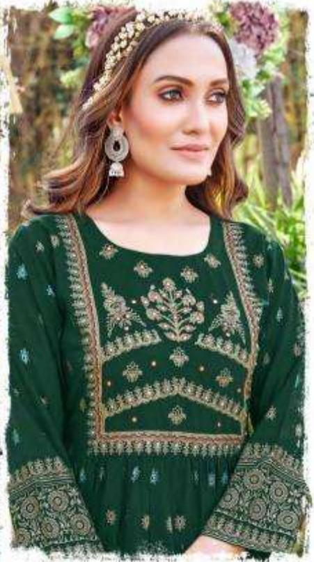
Top With Pant