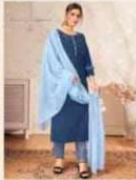
••• Design no. 1008 •••