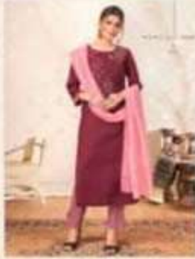
••• Design no. 1003 •••