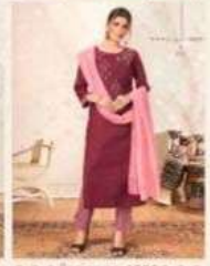
••• Design no. 1003 •••