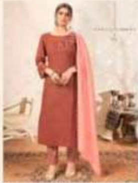
••• Design no. 1004 •••