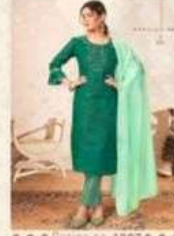
••• Design no. 1007 •••