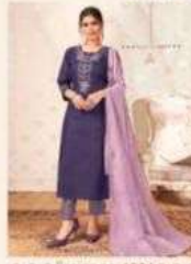
••• Design no. 1001 •••