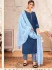
••• Design no. 1008 •••