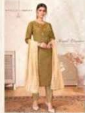
••• Design no. 1005 •••