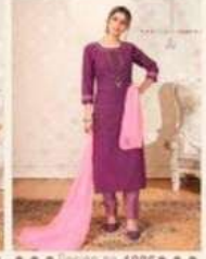
••• Design no. 1006 •••