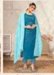
••• Design no. 1002 •••