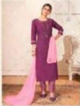
••• Design no. 1006 •••