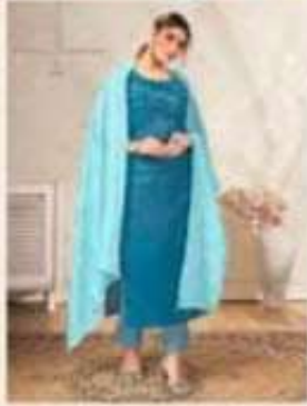
••• Design no. 1002 •••