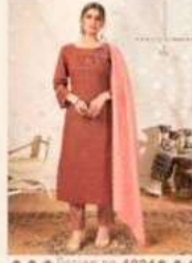
••• Design no. 1004 •••