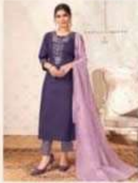
••• Design no. 1001 •••