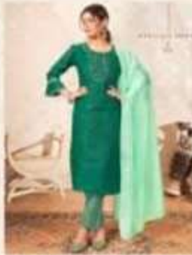
••• Design no. 1007 •••