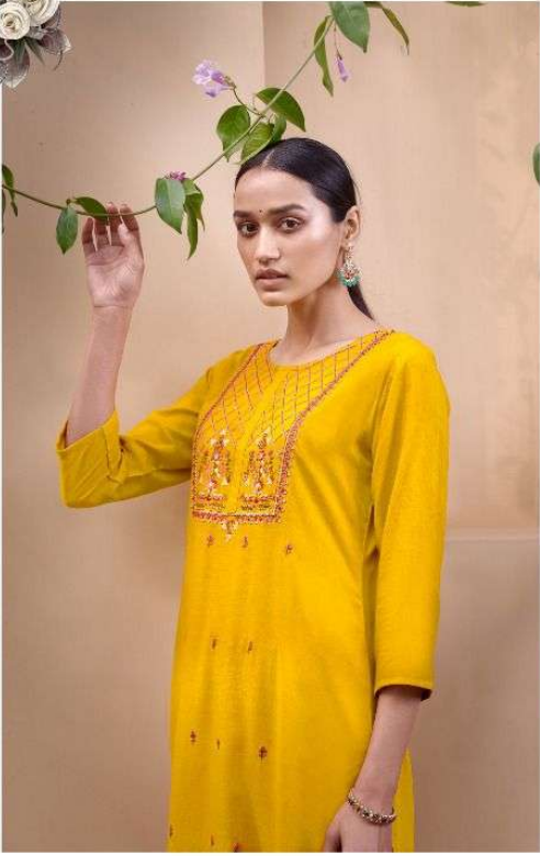
Over the years I have learned that what is important in a dress is the woman who is wearing it. 1002