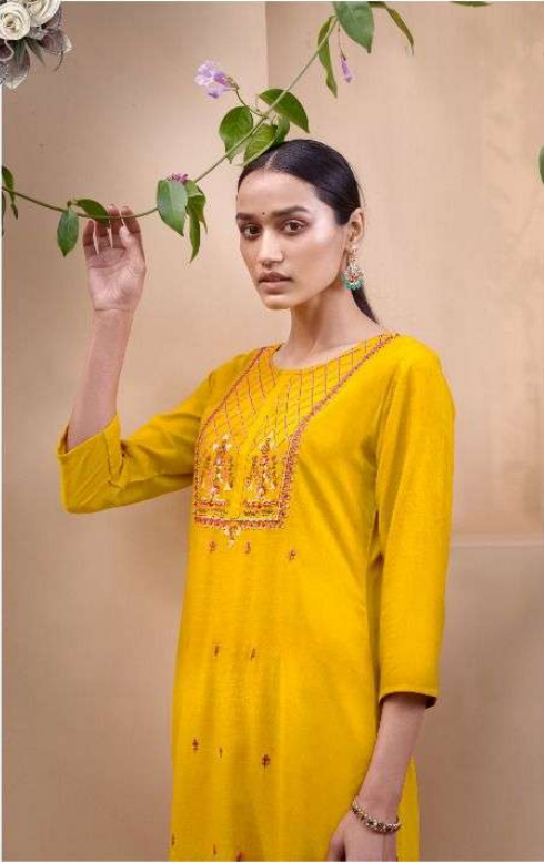
Over the years I have learned that what is important in a dress is the woman who is wearing it. 1002