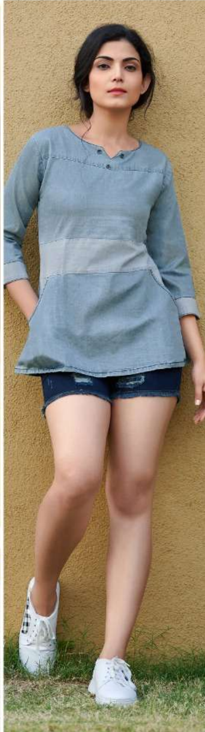
DESIGN - 6005