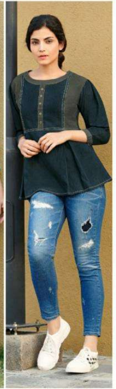
DESIGN - 6006