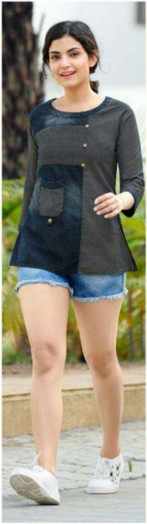
DESIGN - 6001