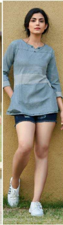
DESIGN - 6005