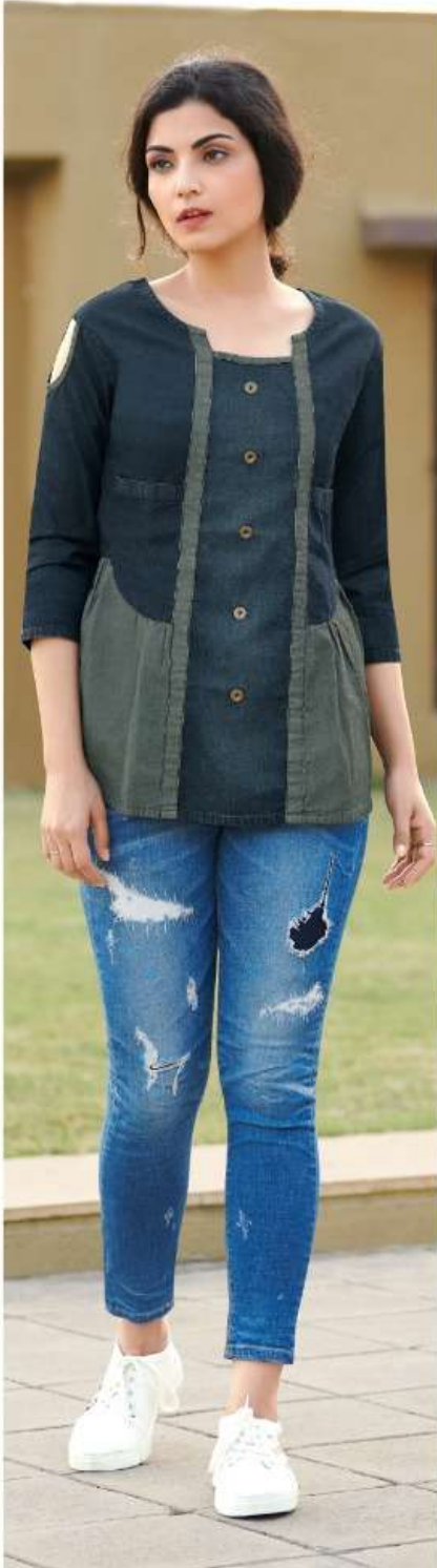
DESIGN - 6004