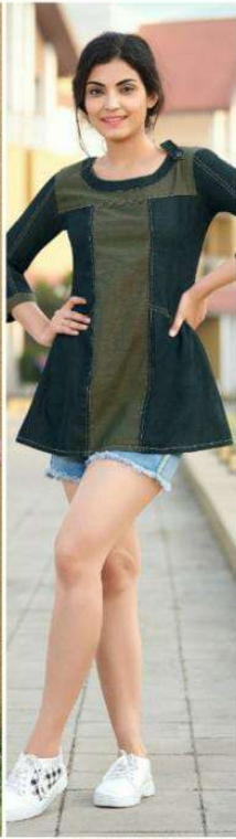
DESIGN - 6003