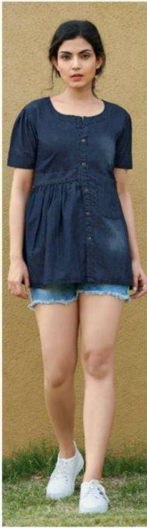
DESIGN - 6002