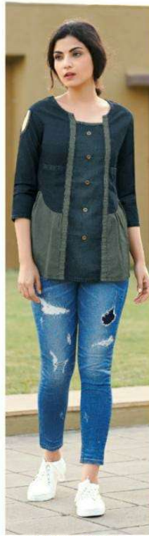
DESIGN - 6004