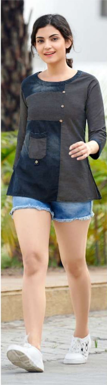
DESIGN - 6001