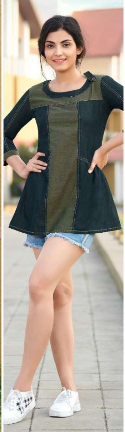
DESIGN - 6003