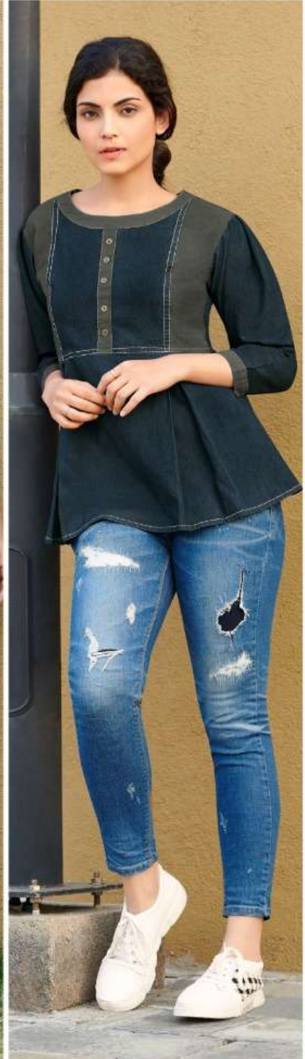
DESIGN - 6006