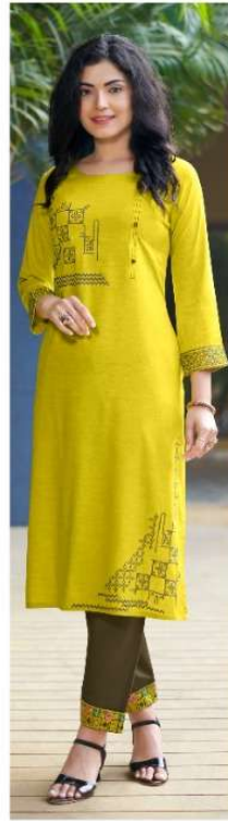
PAGE - 1004