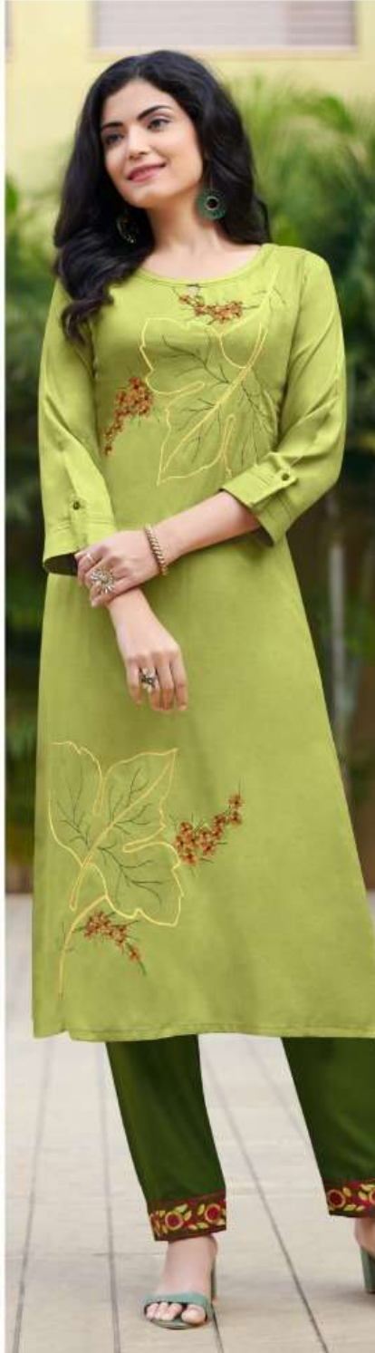
PAGE - 1002