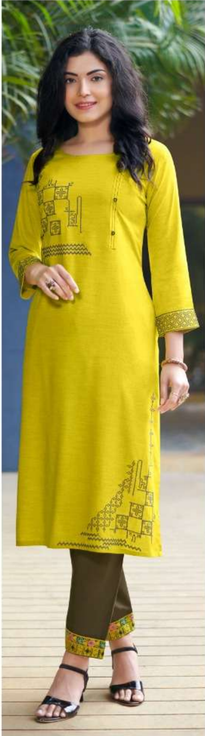
PAGE - 1004