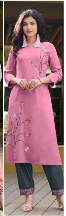
PAGE - 1006