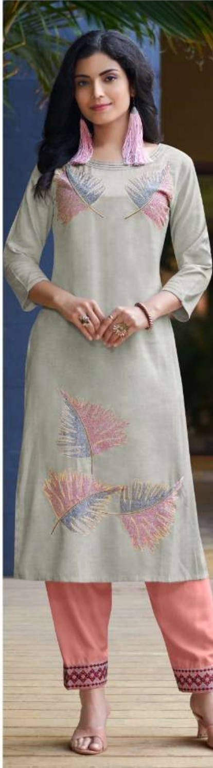
PAGE - 1005