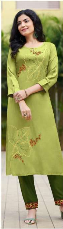
PAGE - 1002