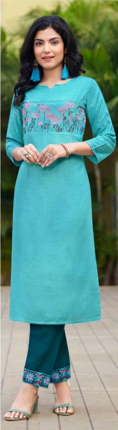
PAGE - 1001