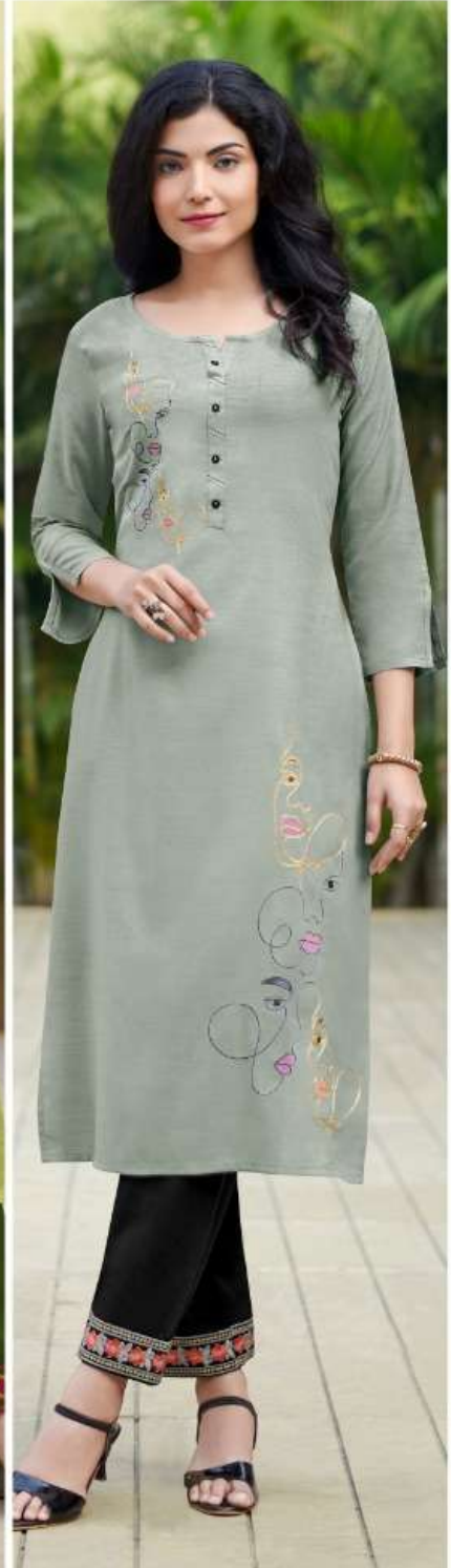
PAGE - 1003