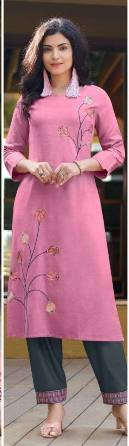
PAGE - 1006