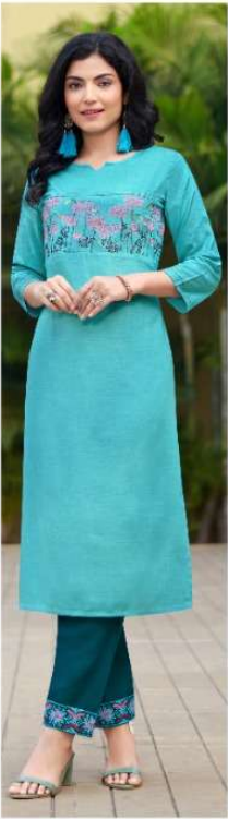
PAGE - 1001