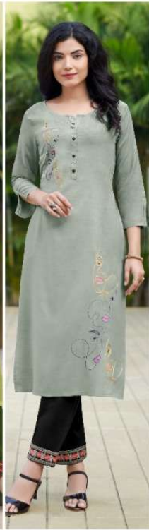
PAGE - 1003