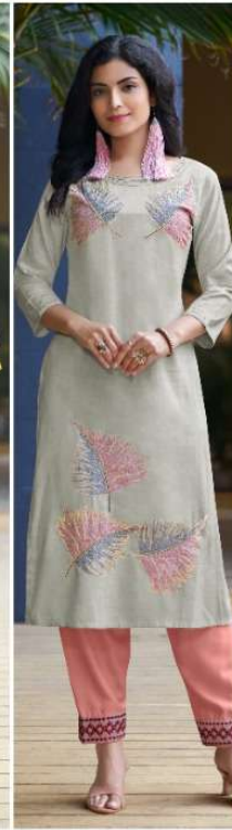
PAGE - 1005